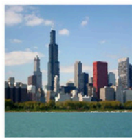
The 1st Leadership Conference May 21, 2005 Chicago, IL

Thank you to KOWIN US Eastern Region members for your dedication and contributions in making our leadership conferences successful over the past 20 years!