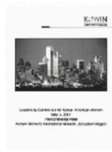
The 3rd Leadership Conference May 5, 2007 Dallas, TX