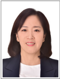
여성가족부장관 직무대행 차관 신영숙

Ministry of Gender Equality and Family Republic of Korea