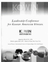
The 2nd Leadership Conference March 4, 2006 New York, NY