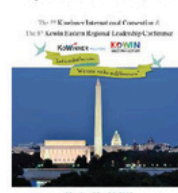
The 8th Leadership Conference May 2, 2015 McLean, VA