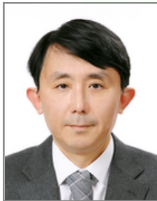
시카고총영사관 총영사 김 정 한

Consulate General of the Republic of Korea in Chicago