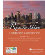
The 7th Leadership Conference September 20, 2014 Dallas, TX