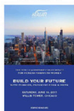
The 9th Leadership Conference June 10, 2017 Chicago, IL