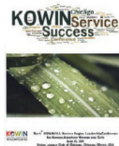
The 5th Leadership Conference June 18, 2011 Chicago, IL