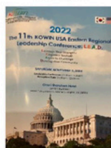
The 11th Leadership Conference November 5, 2022 Washington, DC